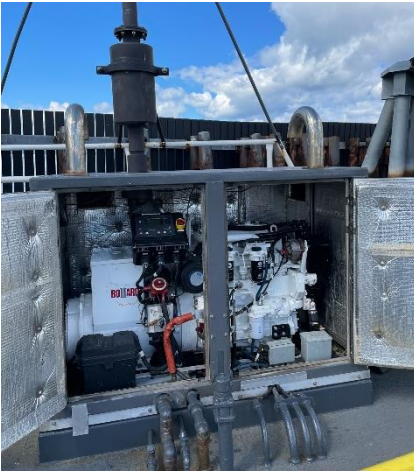
Ferry Auxiliary Generator