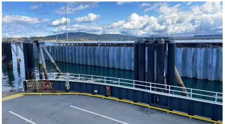
Inboard bulwarks are the “walls” pictured here around the car deck which will be repainted

Installing two hydraulic pumps and one electric pump, maintaining full redundancy to the firemain system.