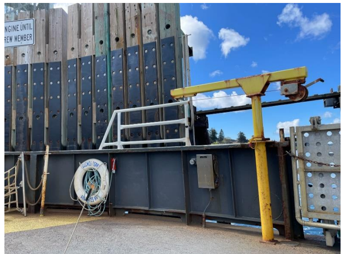
Man Overboard Davit (Yellow Arm)