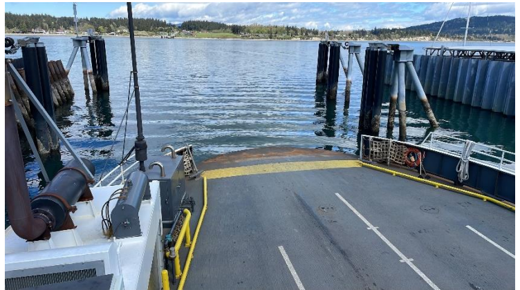
Apron Slide Area (front of car deck) to be re-coated

Abrasive prep and application of a high-durability coating system to reduce address wear on apron contact surfaces.