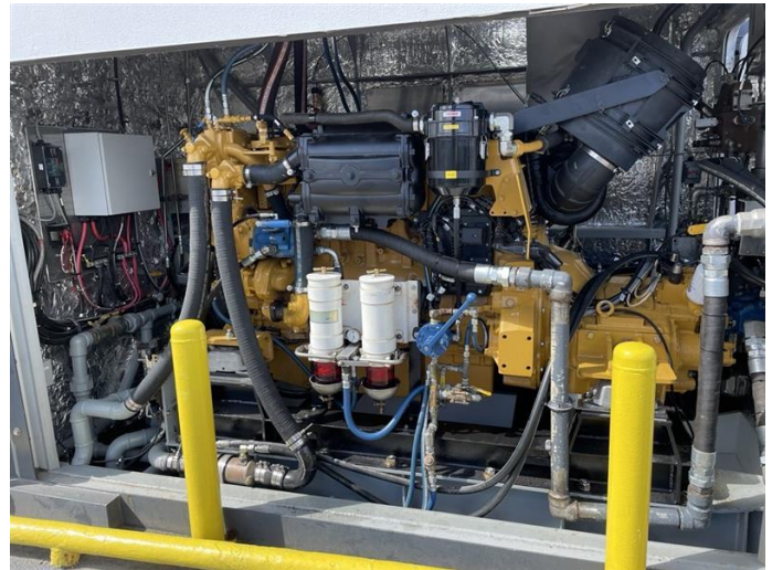
Ferry Main Engine

Replacing the winch and other worn components and recoating the swing arm and stanchion to ensure reliable operation during emergency recovery.